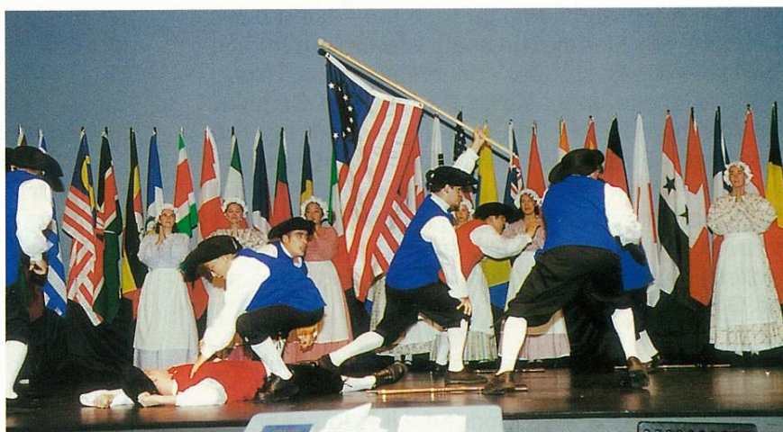
May God Make America A Kingdom Of Priests And A Holy Nation