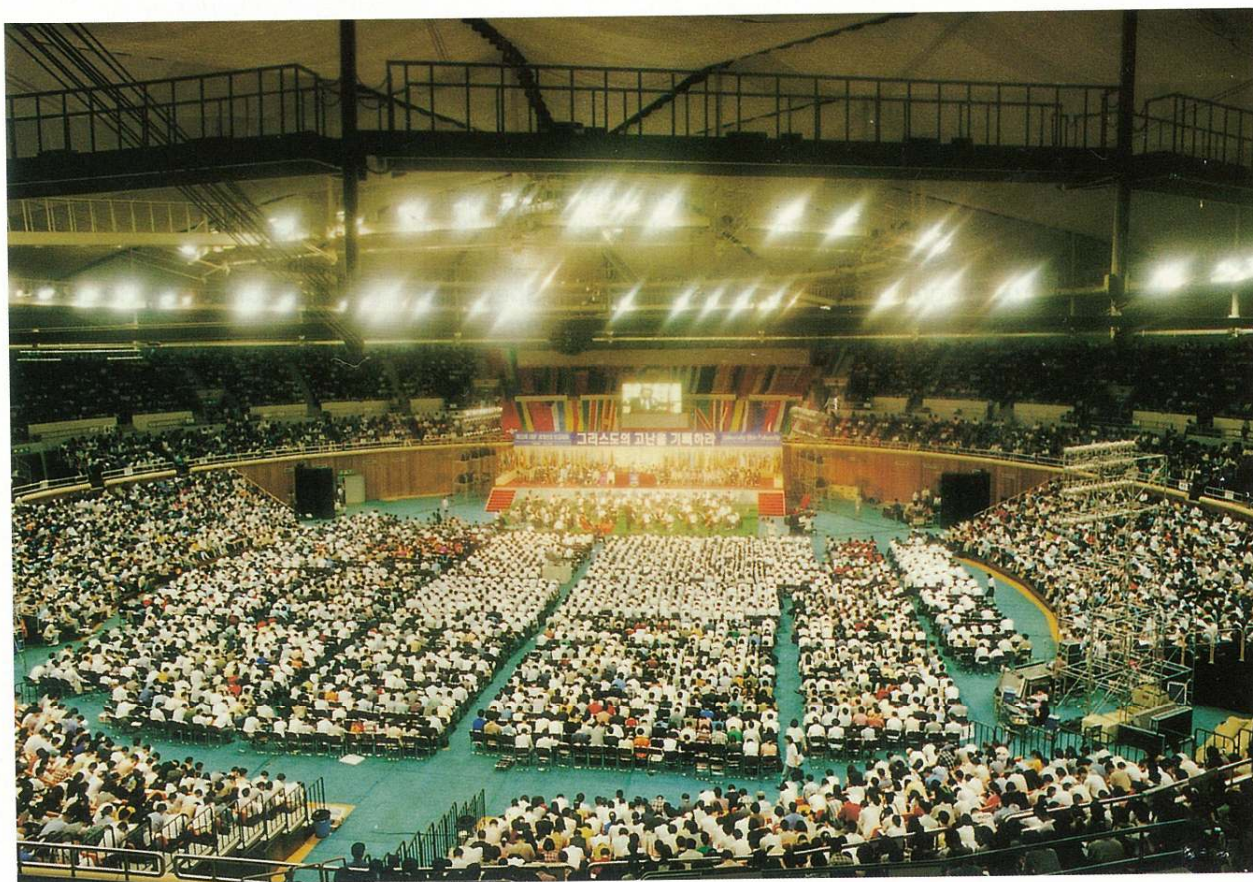
REJOICE IN JESUS' SUFFERING: Korea, A Missionary Sending Nation (WMR Seoul, 1998)