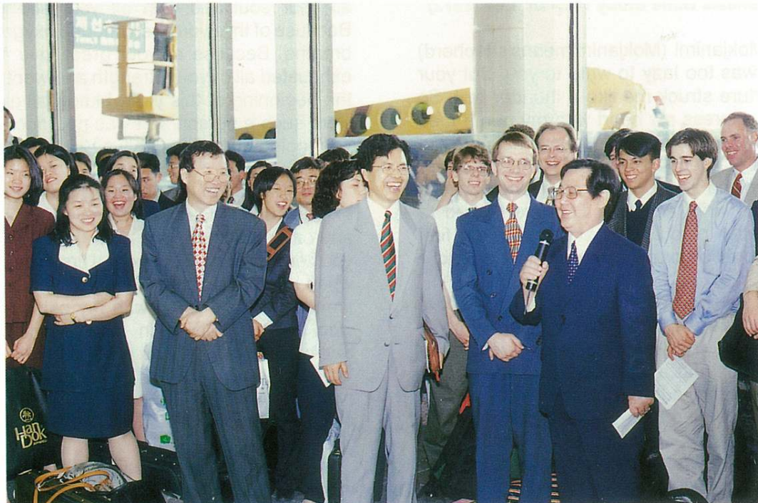
Announcements That Always Made Us Laugh (Seoul, 1998)