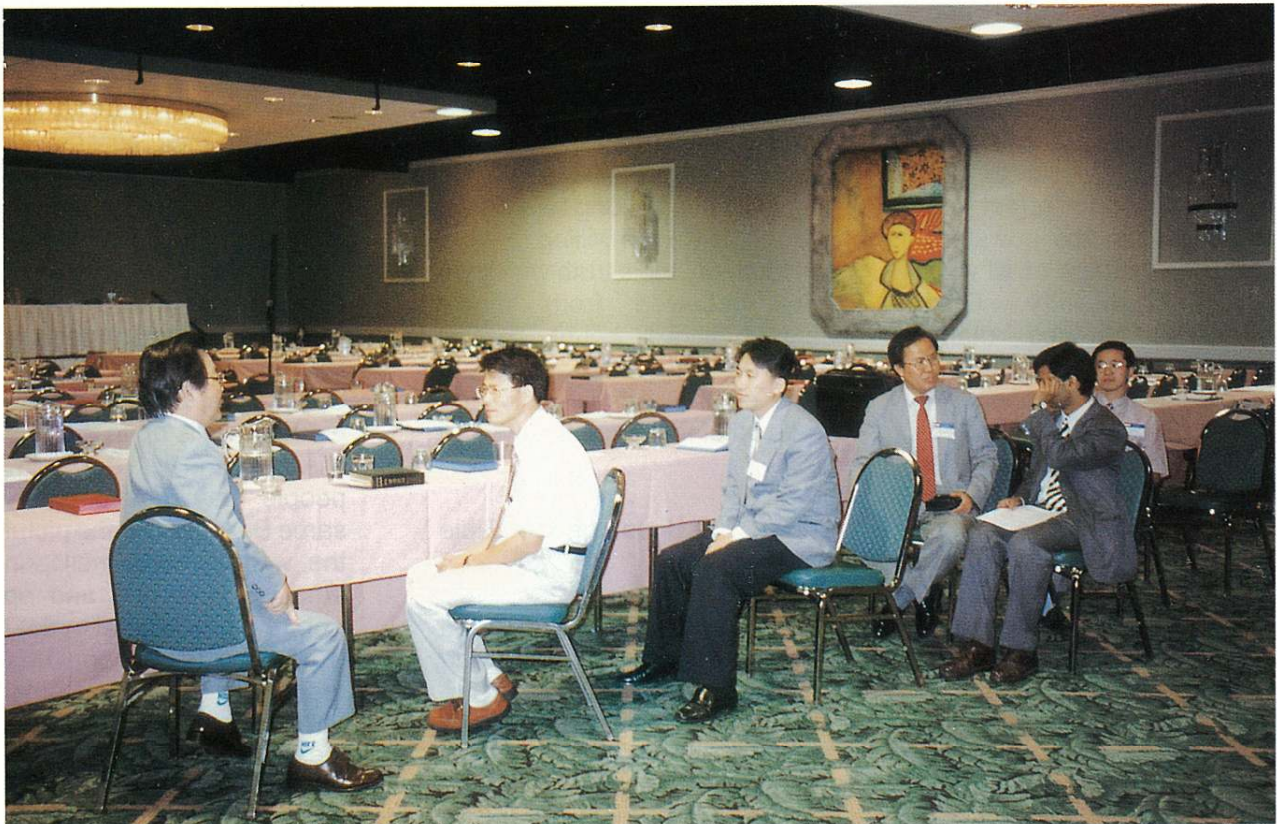
Serving International Directors One By One (1999)